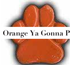
Orange Ya Gonna Play

Matte red. Solid/even in color. Can be sponged off larger pieces such as the lobster to create highlights per request.