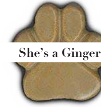
She's a Ginger

Rich golden-yellow with creamy areas where glaze pools.