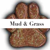
Mud & Grass

Glossy deep brown/maroon with highlights of gold in areas where glaze pools. Extreme variation to be expected.