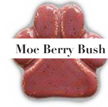
Moe Berry Bush

Glossy, deep pink with subtle purple flecks.