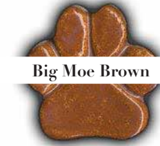
Big Moe Brown

Glossy brown with swirling crystals and chocolate brown highlighting carved details. Works well with finely detailed pieces.