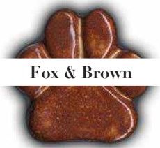
Fox & Brown

Glossy rust brown with soft gold highlights in areas where glaze pools. Extreme variation to be expected.